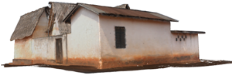
3D Model of Ashanti Shrine near Kumasi, Ghana

ing in Africa through the presentation of workshops and by inviting local students to participate in field campaigns.