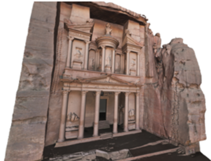
Textured 3D model of Al Kazneh-The Treasury- in Petra

churches of Lalibela and close to 20 billion points for the structures and the terrain in Petra, Jordan. At the beginning of the project, sites were recorded with a few hundred setups while more recent projects are based on between 1000 and 2000 instrument set-ups. In response to the tendency to view archaeological and historical sites in the context of their environment, not only 3D models of buildings but also of the surrounding terrain are documented by fusing terrestrial scanning with DTM derived from aerial photography or airborne scanning. In a somewhat different application of the same technology, the entire Valley of the Queens in Luxor was documented by the Zamani team for the Getty Conservation Institute. The 3D model of the valley was required for the design of flood mitigation measures. Local conditions prohibited the use of aerial data acquisition method and the model of the valley was generated, in much detail, based on terrestrial scans only.