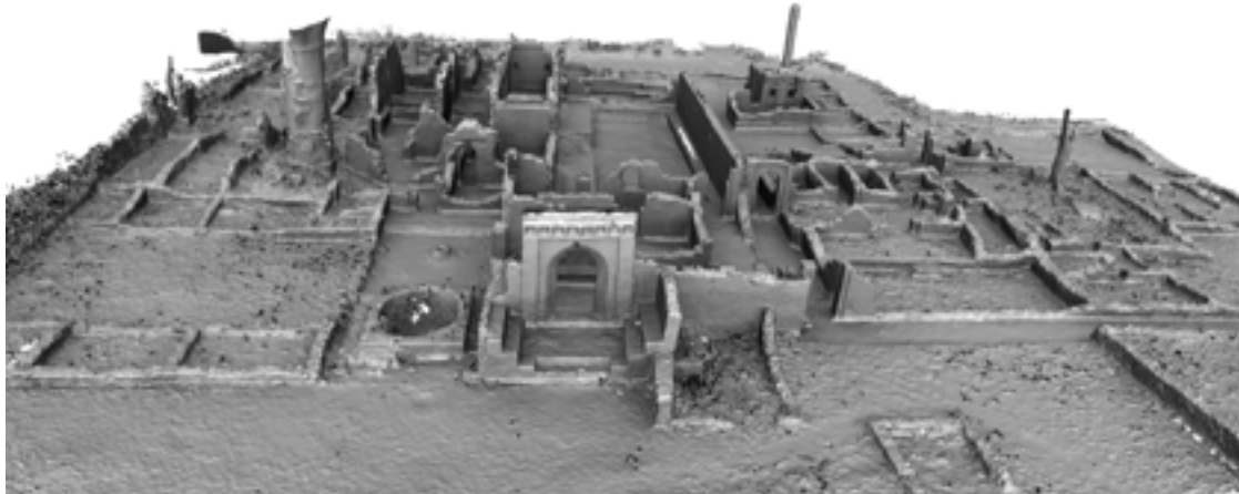
Un-textured model of a Swahili Palace in Gede, Kenya

Ghana, it took only one day to scan a significant part of the castle from 130 scan positions and create a preliminary textured model based on automated registration and HDR software. However, completion of the models still requires fine registration and significant time is required for cleaning unwanted objects from the scans.